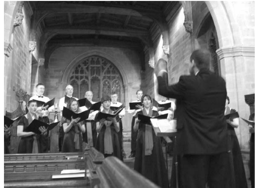
The Abbeydale Singers in action at All Saints, Youlgrave, last month, raising money for the Church Roof Appeal.

Last Tues of month Youlgrave Parish Council meeting, Youlgrave Village Hall Committee Room, 7.15pm