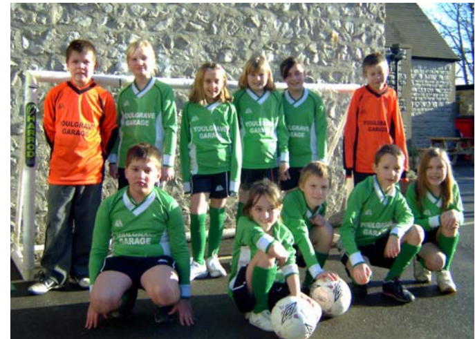
The team show off their new football strip.