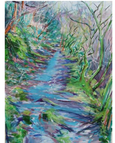
Roughwood Hollow path

For more details call Christine on 636519 or Gallery-S on 580011 www.gallery-s.co.uk