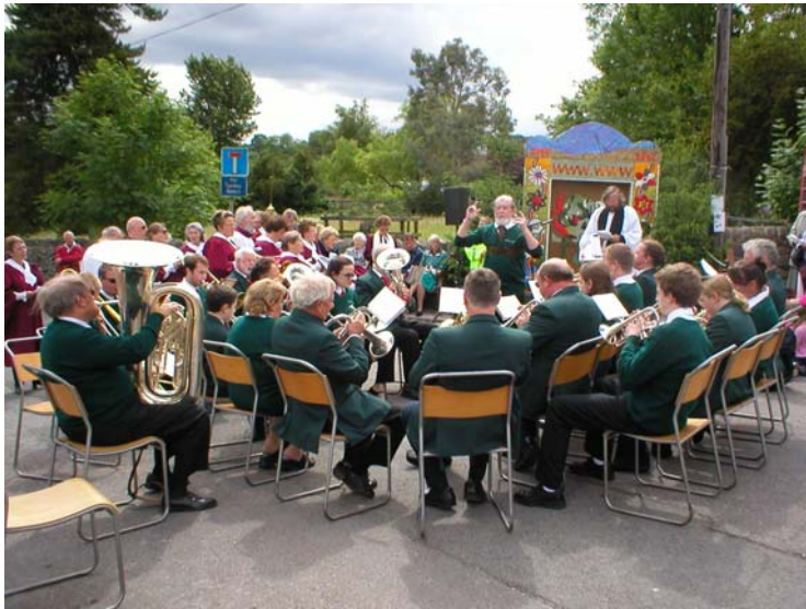
Youlgrave Silver Band performs during Well Dressing Saturday.

The first is devoted to existing photographs of past welldressings. However, this article relates solely to the second exhibition, which is devoted to Youlgrave's history, past and present.