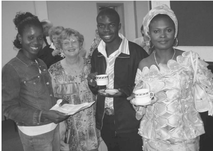
Stylish visitors at the group's AGM in the Reading Room.