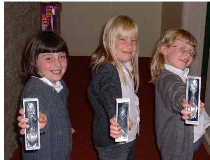
All Saints pupils show off their Jubilee spoons in 2002.