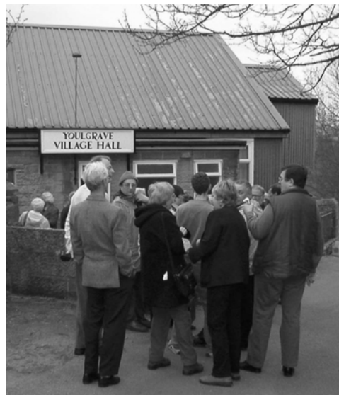
The queue for the best seats starts to form.

Big screen films returned to Youlgrave Village Hall last month as the newly re-launched Youlgrave Cinema held its first screening.