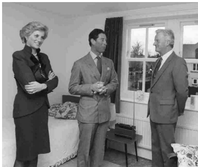
A royal opening – Granby House receives two very special

To find out more about Granby House, or to arrange a visit, contact the Housekeeper on 636061, or write to Rosemary Trapp at Granby House, Alport Road, Youlgrave DE45 1WN.