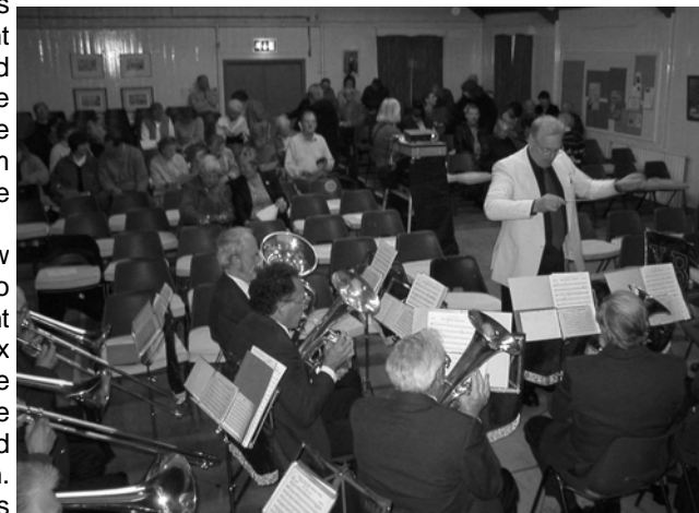
Youlgrave Band gets the growing audience in the mood.

Youlgrave Cinema is now looking to apply for funding to purchase projection equipment and renovate the projection box in the village hall. If the application is successful the first full season of films could begin as early as this autumn. So make sure to watch this space!