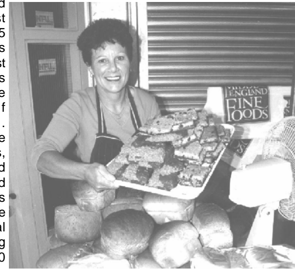
A local bakery selling its wares at the market

Peter Corke, Consultation and Local Agenda 21 Officer at Derbyshire Dales District Council is pleased that the markets are restarting. "Farmers' Markets provide a valuable outlet for local produce and they have proved extremely popular with stallholders and shoppers alike. This