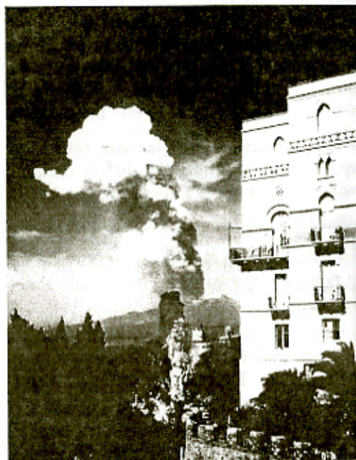
Etna signals her feelings after the tourists visit

POTS FROM FRANCE EXHIBITION, BANKSIDE COTTAGE