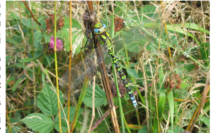
Southern hawker dragonfly

There have been two reports of water voles above Braemar bridge. The first was on the 8 June, then I saw one on the 20th. I was looking for water voles signs and had both grazed vegetation and a pile of poo in my binoculars when a vole actually swam into my field of view. I was also sent a very good photo of a bank vole or field vole taken just above the Holywell Lane clapper bridge.