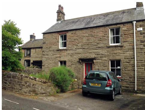
Stanton House and Lindon Cottage

Lindon Cottage (Grade II listed) was built as a pair of cottages but is now one dwelling. It has been little altered since construction, retaining many of its original features. It was once owned by