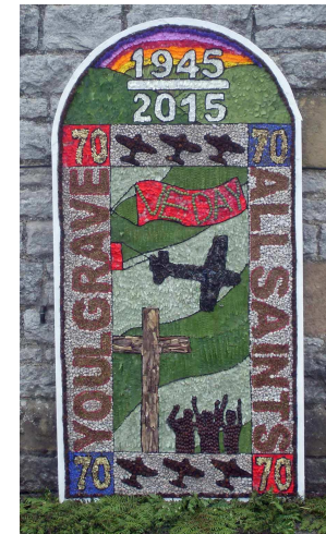
The schoolchildren produced another impressive well dressing this year.