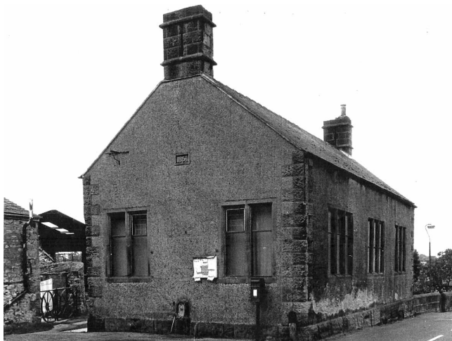
Youlgrave Reading Room