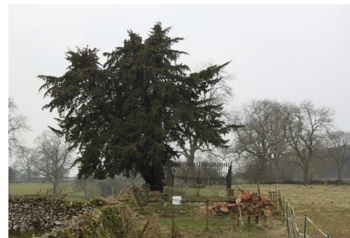
The newly crowned yew at Bateman's Tomb, now in the care of Middleton by Youlgrave Parish Council.

If you are interested in standing you will find a link to the DDDC downloadable nomination papers on the Parish Council Meetings page of our website or go to www.derbyshiredales.gov.uk/your-council/elections/2015-elections/town-and-parish-council-elections .