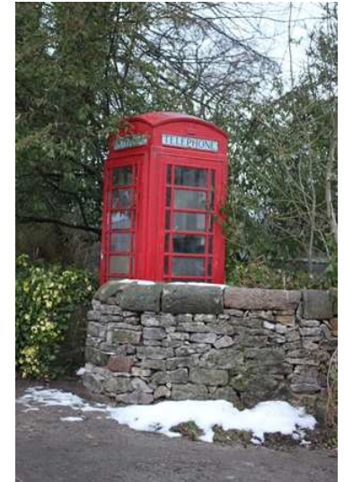
The old phone box off The Square at Middleton – soon to be home to the village's new defibrillator.

Finally can we remind parishioners that local council elections take place on 7 May for the five parish councillors.