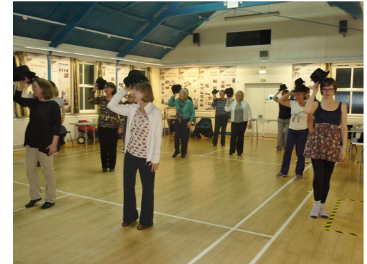
The W.I. Perform Chorus Line

The lunch at Biggin Hall was a success, as usual, with much chatter and friendship filling the lovely dining room.