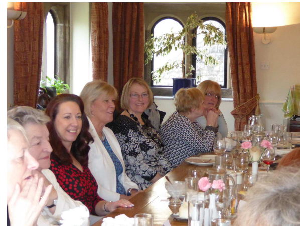
Lunch at Biggin Hall