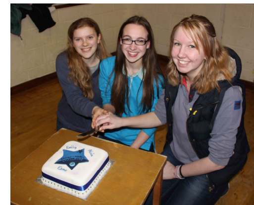
Youlgrave's three BP award-achievers.

Earlier in March we took 20 Guides away for a spring weekend to Consall Scout Camp in Staffordshire. We began the weekend with a Wide Game on the Friday night, followed by shelter-building and fire-lighting on the Saturday. The Guides made some tasty