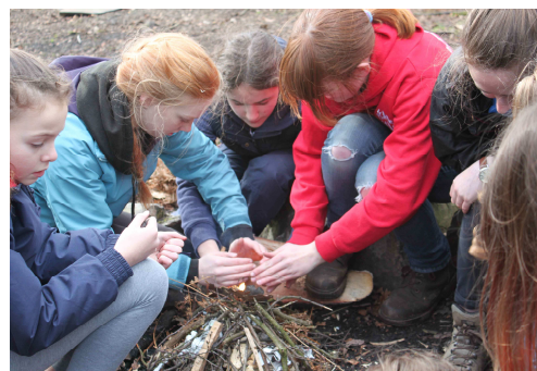
Fire-lighting at the Spring weekend.

On the last evening of the term we welcomed the County Commissioner to present three Guides with their Baden-Powell Award, the highest award a Guide can achieve. The carried out a wide range of activities from five different areas: Healthy Lifestyles, Global Awareness, Discovery, Skills & Relationships, and Celebrating Diversity. These girls have not only worked hard to gain their award but also given a lot to the unit in the five years they have spent with us. We are really proud of their achievements and wish them well in the future.