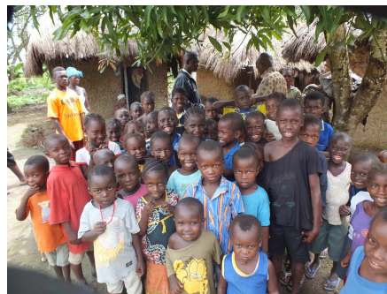
Bangbutt children in happier times.