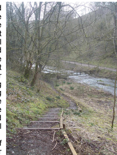
The restored Bankside-King Street public footpath on the north side of the River Bradford.