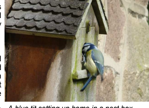
A blue tit setting up home in a nest box.

in the Dale and the leadwort alpine penny cress on spoil heaps around Icky Picky. Meadow saxifrage is out already at the top of Wooden Steps and can be distinguished from the rather similar lady's smock as it has five petals to lady's smock's four. If the spectacular show of blackthorn means anything, then sloe gin makers should