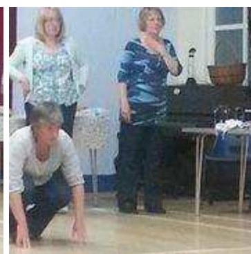
in Olympic hopefuls? WI go kurling at the Village Hall.

and we have a full list of activities as usual, including a day at Renishaw Hall and the County Quiz.