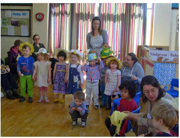
Easter bonnet parade at Youlgrave Playschool.

finished for the Easter break, giving the staff a well earned break. That morning's session included the traditional Easter bonnet parade and a local lamb being brought in to playschool for the children to pet and feed. All parents and carers were invited to attend and enjoy a cup of tea in the setting.