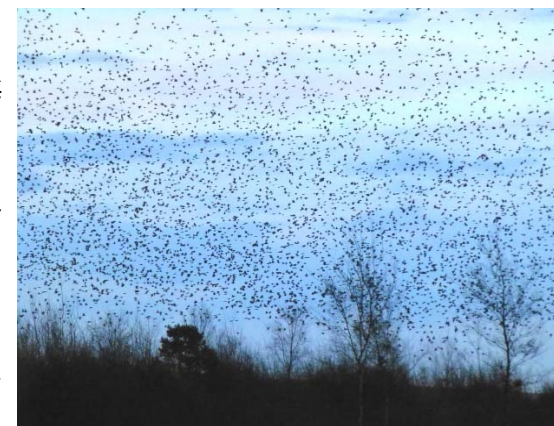
A murmuration of starlings.

buds somewhere? A total of 2 cock and 6 hen pheasants have been under the feeders and we have had the males displaying to each other on top of the hedge and one of them strutting around the females. I hope they were not put off by his enormous paunch from living rather well off the bird food. The sparrowhawk has been an occasional visitor, which means our bird of prey list