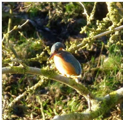
A kingfisher in the Dale.