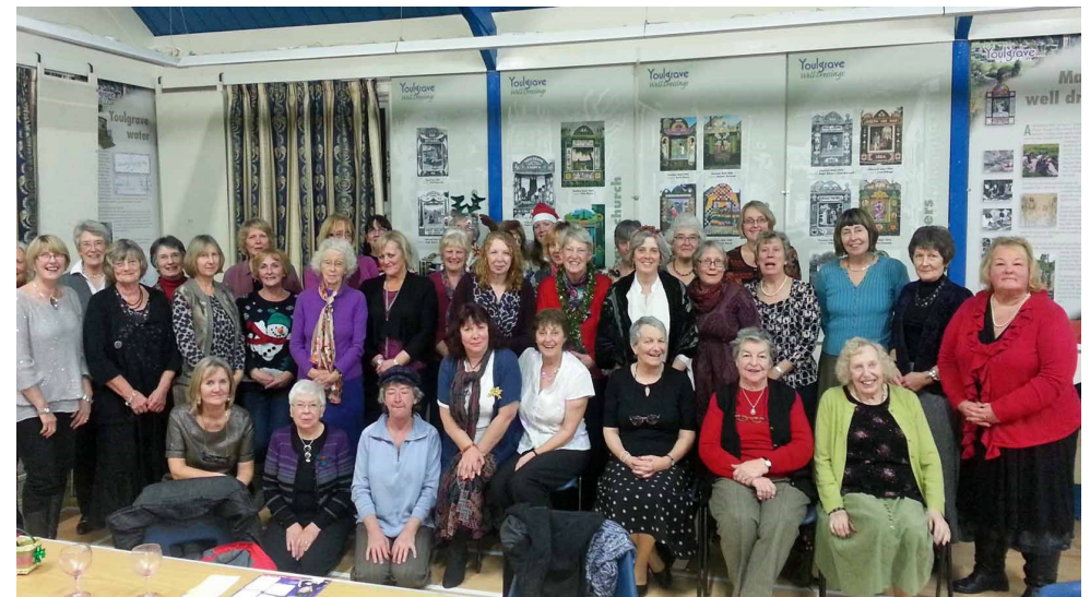
Members of Youlgrave W.I. posed for this splendid group photo at their Christmas party last December. For a full report see page 13.