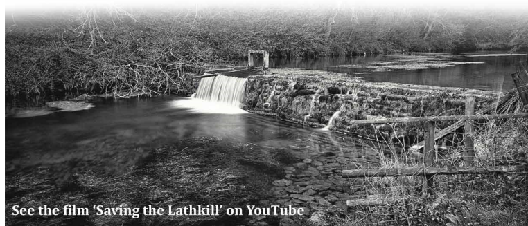
See the film 'Saving the Lathkill' on YouTube

The Haddon Estate, The Environment Agency, English Heritage, Limestone Research Consultancy, Natural England, Peak District National Park Authority, Trent Rivers Trust.