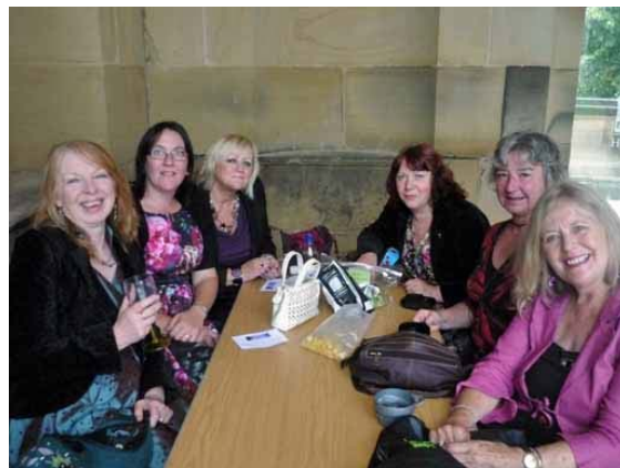
W.I. Ladies at Chatsworth.