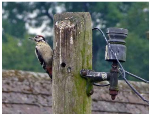
A woodpecker on Grove Place.

It is always easier to record first sightings of birds for the year than last sightings. I was sent some lovely photos of mainly house martins covering the roofs of caravans at Lower Greenfields on 8 September and they disappeared soon afterwards. However this was not the end as there were both swallows and house martins in some numbers over the village on the 13th and I had a report of some on the 22nd. They do seem to have all departed now, though there's always the chance of a passing straggler for a while yet. On 29 August we had a