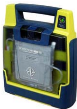
A typical defibrillator.

There are a number of decisions to be taken, including precisely where the unit will be sited (it has to have an electrical supply and, of course, be accessible 24 hours a day). There have already been suggestions that because of its size and layout Youlgrave may need more than one unit; but that would mean double the cost.