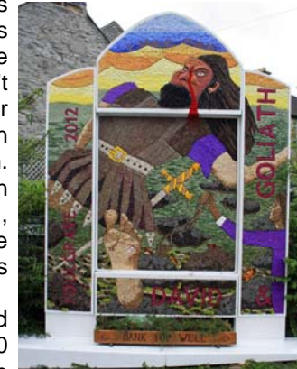
Last year's Bank Top well dressing.

The traditional procession with the blessing of the wells is on Saturday 22 June at 2.30pm. If you usually park on Coldwell End, Main Street. Church Street or Alport Lane, please could you arrange alternative parking for the weekend. Also, please note the road will be closed from church corner at 2.15pm. Thank you.