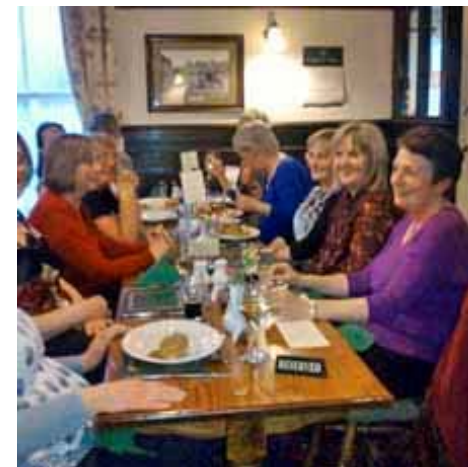
Youlgrave W.I. Supper Club