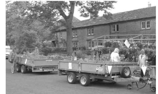
Plant trailers at last year's Village Market.

So please come along to see the work in progress or perhaps help out if you