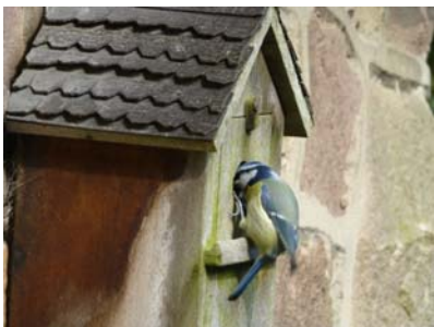
Blue tit on garden bird box.