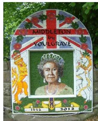
Last year's well dressing.

Teas in the village hall carry on through the extended weekend and the well dressing will