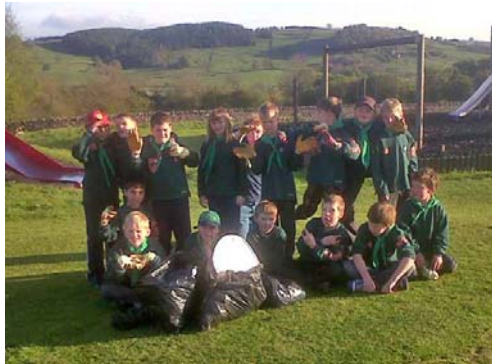
Youlgrave Cubs with the rubbish they collected from the playing fields.