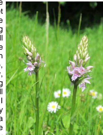
Common spotted orchids flowering in Ian's lawn.