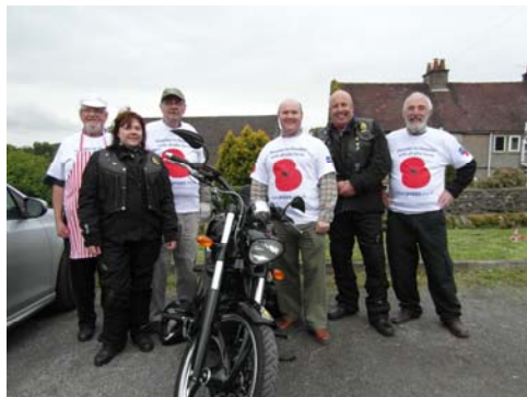
Youlgrave RBL and Ryders Club members.

As part of the branch's work trying to make people aware of the RBL, we are