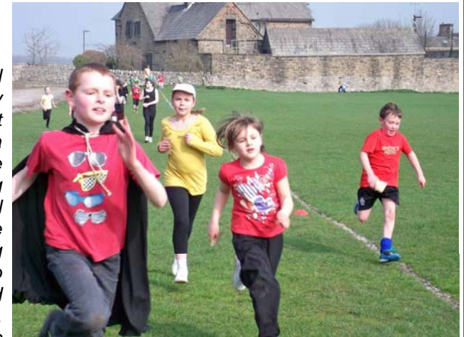
Pupils ran for a mile around Alport Lane playing fields.

Pupils at Youlgrave All Saints' CE (A) Primary School took part in Sport Relief this year by running a mile around Youlgrave Recreation Ground wearing Olympic colours. The School Council, which organised the event, would like to say a big 'thank you' to everyone who took part in the Fun Run and to everyone who contributed. We raised a fantastic £742.20 for Sport Relief! Thank you and well done to the School Council for their organisation.