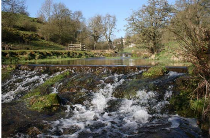
The River Bradford is, for now, fully re-charged.

You may be forgiven for thinking that with the recent rainfall everything is hunky-dory with the River Bradford once more and water levels are back to normal. But for how long? Despite April's prolonged showers, the Midlands has been declared a drought area and overall rainfall totals are still below the average with two exceptionally dry