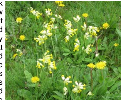
Cowslips on the Alport Lane playing field wildlife area.

April is a month of great change. Winter visiting birds are leaving and the summer birds are arriving. The wild flowers are starting to bloom in abundance. After a heavy snowfall on the 4th, a flock of departing fieldfare was seen from the Friden Road. On the 7th I watched a dunnock visiting its nest in a yew bush, blue tits in and out of a nest box and a wild cherry almost visibly bursting. In the next couple of days I counted 16 species of birds in the garden. The highlights were a pair of bullfinches and a pair of reed buntings. The female reed bunting could be mistaken for a large sparrow at a casual