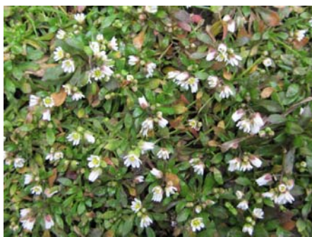
Spring Whitlow Grass

Although the snowdrops seem to be having a bumper year and the crocuses have done well there are few wildflowers about yet. I found dandelions, daisies, groundsel, shepherds purse and the tiny white spring whitlow grass but haven't yet seen the yellow lesser celandine which will soon be decorating your lawns. Tidy gardeners control them but I leave my lawn untreated and get a very good number of wild flowers including, last year, a common spotted orchid. This patch of lawn has been carefully marked and will be very carefully watched. Mosses seem to have thrived in the lawn this winter but, if I control them at all, it is only with a scarifier as chemical