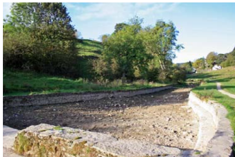
The swimming pool – still dry in late November.

On Monday 7 November over 100 people crowded into the Top Chapel for a meeting organised by villagers to discuss the lack of water in the River Bradford this autumn. By then, parts of the river had been completely dry for 13 weeks and residents were questioning the likely causes and what possible action could be taken.