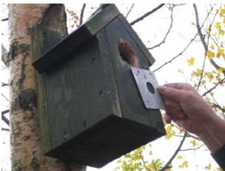
Woodpecker damage – and remedy – on the Playing Fields Wildlife Area.

On 7 November I finally finished grass-cutting the Playing Field Wildlife Area. There were lots of vole runs under the matted dead grass and I had a good view of some redwings. There have been occasional flocks of redwing and fieldfare over the village, but any reports of these in gardens would be appreciated.