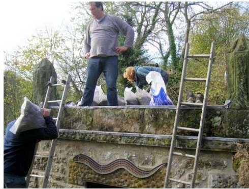
The new roof on Bankside takes shape.

The long sunny autumn has been very lovely in the Wildlife Garden, with dragonflies as late as 7 October! We decided to have a celebration of the garden with tea, photos and recordings of the concerts. This took place in the Reading Room and allowed some of us to recover from the morning activity of putting the substrate on the roof of the summer house in the garden. This now means we have a green roof on the building and all we have to do now is wait for the flowers and grasses to appear in the spring!