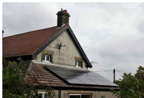
Top: Panels being fitted on a house on Grove Place and (below) already in place on a house on New Road.

financial outlay, using your roof in return for lowering your electricity bill. That's a whole other ball game, not currently considered a good plan.