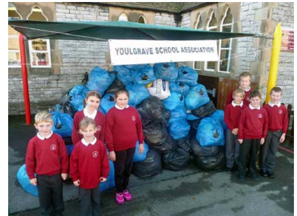
A great haul of blue bags – thank you!

If there are any budding Martha Stewarts out there we are hoping to have a stall selling homemade preserves and goodies which would make suitable gifts. Anybody willing to