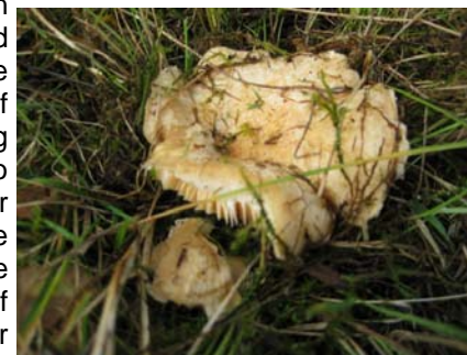
Mystery fungus on the Playing Field Wildlife area.

The migrant birds will soon be gone, but there were plenty of house martins and swallows over the village on the 16th. On the 11th I saw a wheatear at