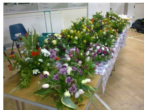
"Some amazing arrangements were created."

Youlgrave WI is a wonderful group of girls and a great place to meet, chat, learn and relax together. Our numbers have grown in the last few years and we would love for that to continue. If you are interested in our group, joining or to know more, please do come along to our Open Meeting in July!