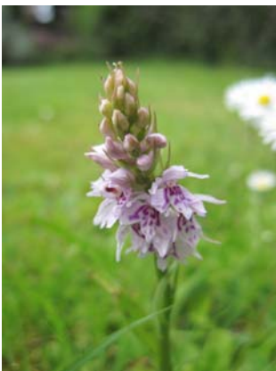
Common spotted orchid – as discovered in Ian's own lawn!

My big thrill this month was finding a common spotted orchid in flower on my lawn on my return from holiday! This prompted me to have a look round the village for more. Icky Picky yielded 16 species of flowers in bloom, including the rare spring sandwort and alpine pennycress, but no orchids. The maiden pinks were not yet in bloom. The Dale gave a good number of common twayblades between the third and fourth dams but no other orchids. Twayblades are worth a close look.