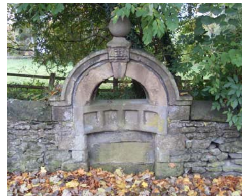
The tap on Main Street, just along from the junction with Holywell Lane, is among the best preserved in the village.

Youlgrave Waterworks is very keen to see the taps preserved and now a possible source of funding has been found. Peak District Rural Action Zone, funded by the EU, has encouraged us to apply.