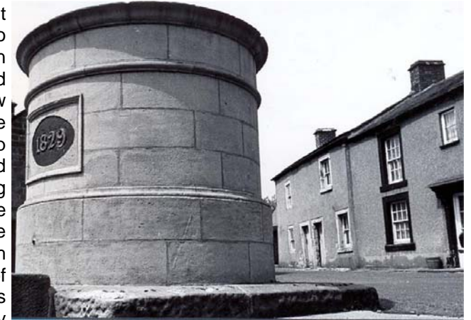
The Fountain or Conduit Head before the railings.

The tap spot stonework would be repaired and a new tap and drain grill installed where necessary. The Fountain would be restored with a new tap, which might even have a real fountain circulating water, thus creating a new and attractive feature in the middle of the village. It is a Scheduled Monument (confirmed as a Grade II listed building) so we are consulting the Peak Park about its restoration. We would also provide interpretation boards, probably at the Reading Room, where there is a tap-spot in the end wall, telling the story of Youlgrave's water supply and encouraging people to walk the village to find the other taps.