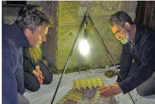
Moth detecting on Bankside.

On the evening of Friday 14 August a group of people from the Sorby Natural History Society came to Bankside Wildlife Garden to set up a moth-watching evening. It was a fascinating and intriguing event, with an extraordinary diversity of moths fluttering around the two lamp areas set up in the garden. Later in the evening we also had some pipistrelle bats flying over – almost certainly thinking we had arranged a banquet for them! Moths are a favourite food for bats. We hope to repeat the event and would also like to set up a bat evening with some bat detectors. Please do contact us if you are interested in either bats or moths or have any specialist knowledge. Call Maggie on 636189.