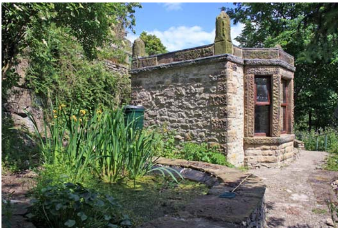
The restored summerhouse and pond at the Wildlife Garden on Bankside.

So, the garden became a reality. The land was transferred to Trustees from