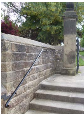
The handrail finally installed last month.

A further DCC email confirms that they are awaiting delivery of the handrail "and will