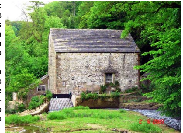
Alport Mill – site of Haddon's new hydro development.

Haddon's successful planning application was supported by both