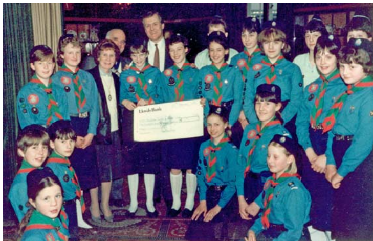
In 1985 Youlgrave Guides won a prestigious regional award for turning a piece of wasteland behind Youlgrave's Wesleyan Chapel into a colourful and blooming garden. Here they are pictured receiving the winner's cheque from Lloyds Bank, who sponsored the national competition called 'Adopt and Cherish'.