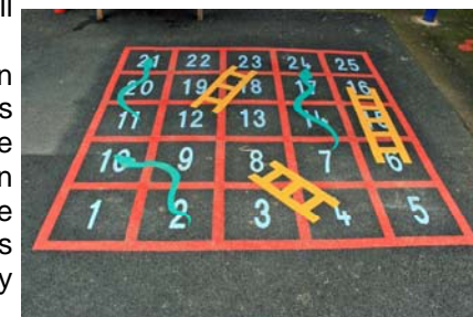
The colourful and popular new playground markings.