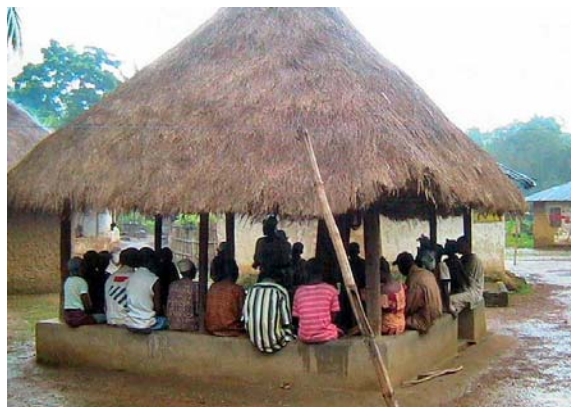
A 'Learning Circle' in Bangbutt.

We saw three such role plays: a fire arsonist at work; a family of a husband, two wives and two daughters, only one daughter being allowed to go to school; and finally a vivid drama of how the HIV/AIDS virus can attack people. At the end of the sessions, some of the participants stood up and told us how they had benefited from these sessions; how they now have confidence to stand up and speak for themselves; how they realize the benefits of working together in a group to sort out problems; how they can now